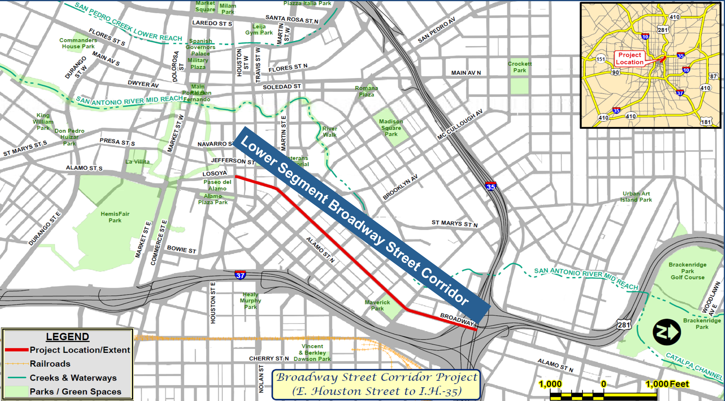
Broadway Street Corridor Project (E. Houston Street to I.H.-35)